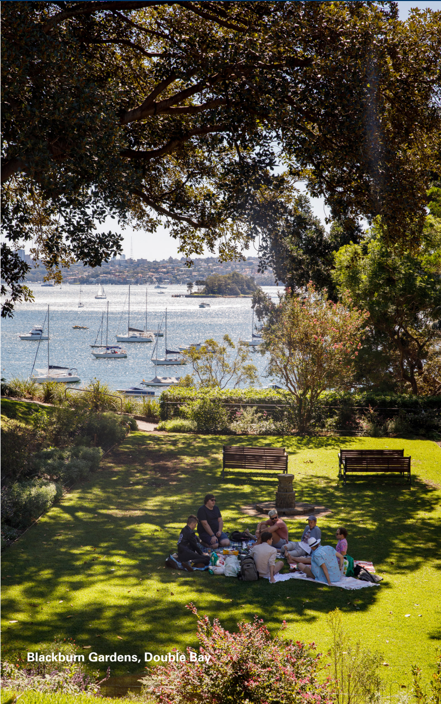
Blackburn Gardens, Double Bay