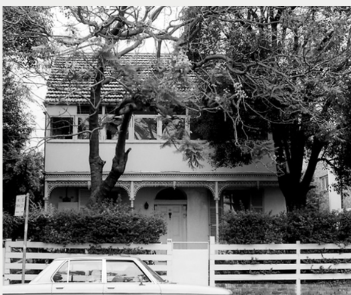
1982, West Woollahra Field Survey

From 1932 to 1951, "Clyde Cottage" was the childhood home of operatic soprano Dame Joan Sutherland OM, AC, DBE, following her father's sudden death. Her maternal grandfather had long before enlarged the 1850s single-storey cottage, which comfortably