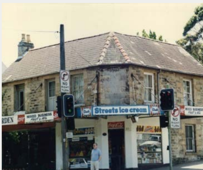
1991, Woollahra Libraries Digital Archive rne044a

The oldest surviving shop in the area has housed a butcher, fishmonger, boot warehouse, green grocers, stationers, oil and colour merchant and general store. The Parterre Garden has been a fixture on the Ocean Street frontage for forty years.