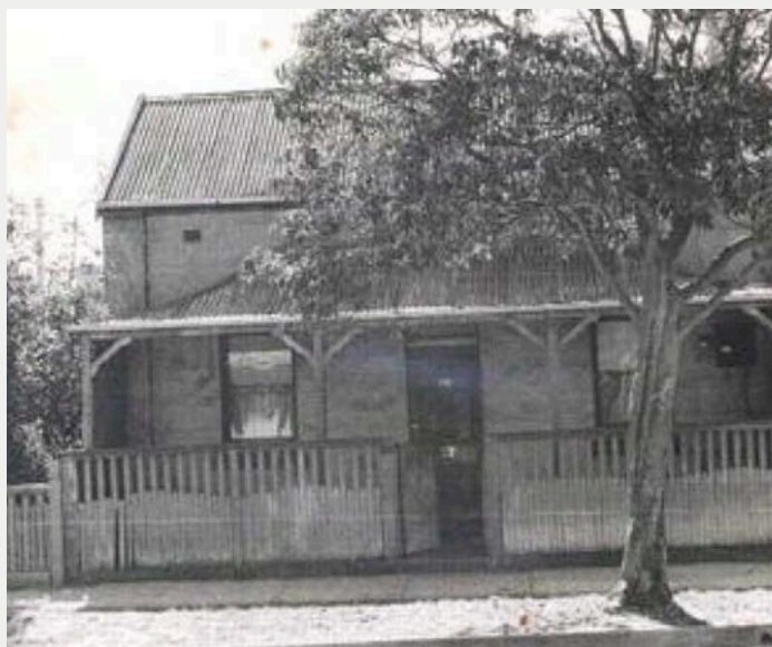
Pre 1970s