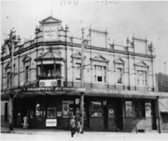
Aklands Hotel c1900 pf008321

Henry Akland built the substantial hotel captured in this image c1887. In the 1930s it was completely rebuilt as the Art Deco hotel on the site today. Now known as the “Woollahra Hotel,” that name was once attached to a hotel at #43 Queen St, built c1871 (see Stop 13).