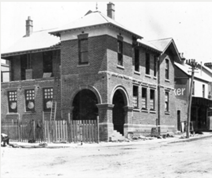
The Woollahra Post Office Woollahra Libraries Digital Archive PF008317

earliest postal ‘service’ had been the installation of a pillar box on the kerb outside Thomas Griffith’s corner shop, in 1865 (See Stop 3). Later, a post office operated from a draper’s shop in Ocean Street. The 1905 building was the first purpose-built local structure for postal services.