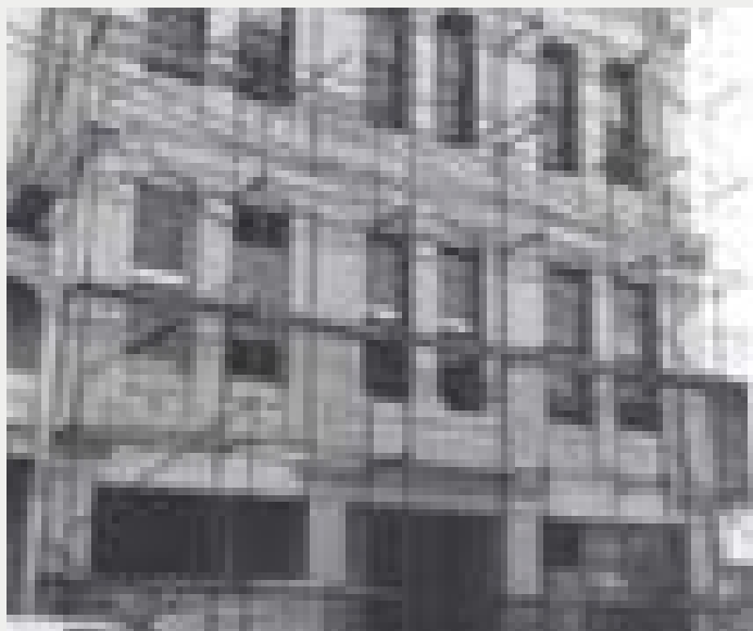
1976, Woollahra Libraries Digital Archive pf001876

Built in the late 1860s, the three-storey façade was completed by 1870 and a hall added in 1922. #38 housed the Oddfellows Hall, which started with 107 members in 1863. The Oddfellows held meetings every Tuesday and provided a health care fund. By 1930, the building