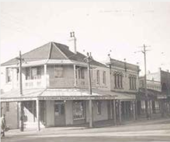
1958