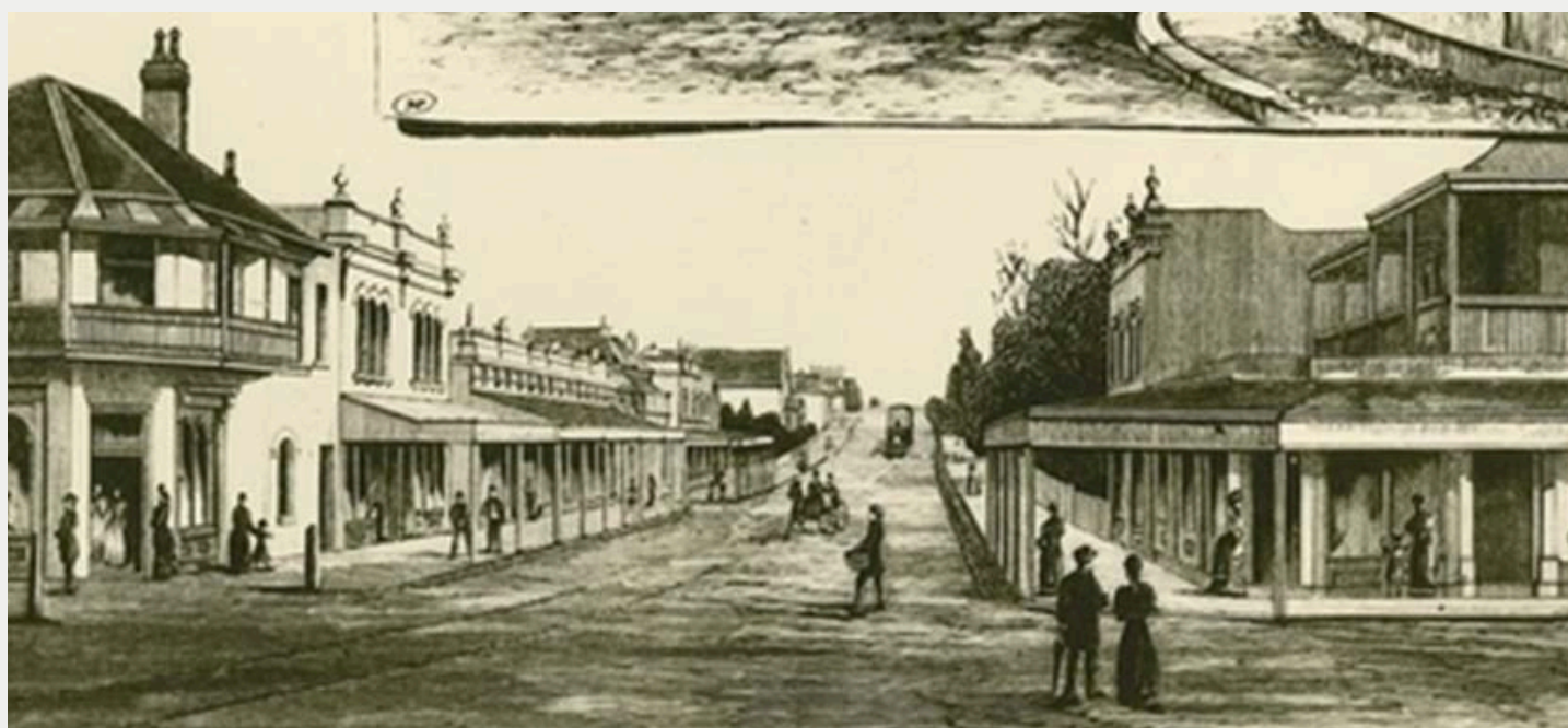
1884 view with tram looking east down Queen Street at Moncur Street corner. Woollahra Libraries MS 182.

This walk of approximately 20 minutes takes you along Queen Street from east to west, stopping at 21 sites along the way. Follow the northern side of Queen Street from the Nelson Street intersection to the Oxford Street crossing and return on the southern side.