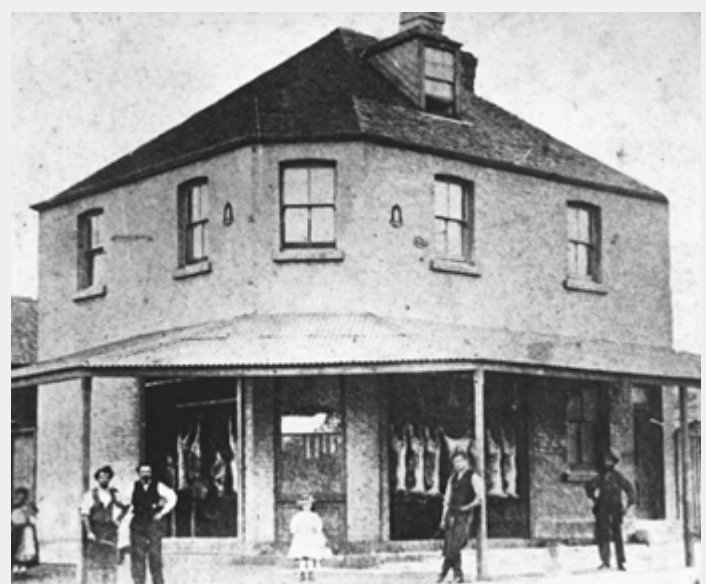
1890, Woollahra Libraries Digital Archive pf008373

Before the Woollahra Post Office was built – seen here under construction in 1905 - Frederick Konneke operated a butcher shop (seen below) from this corner of Moncur and Queen Streets. The Post Office closed its doors in 2011 and now houses a few small, commercial tenancies. Queen Street’s