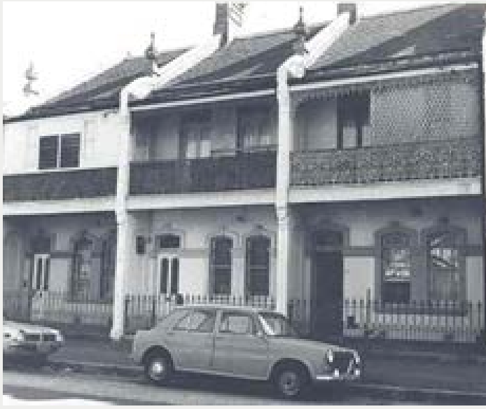
1976, Woollahra Libraries Digital Archive pf001871

This group of four 1888 Italianate terraces illustrate the late 19th century building boom. The four were built by Emanuel Saber, a man of considerable means who lived at “Runnymede, currently #23 Jersey Road, a modest-sized Victorian mansion set in a generous garden. He