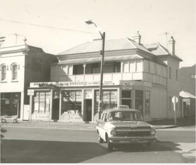
1966