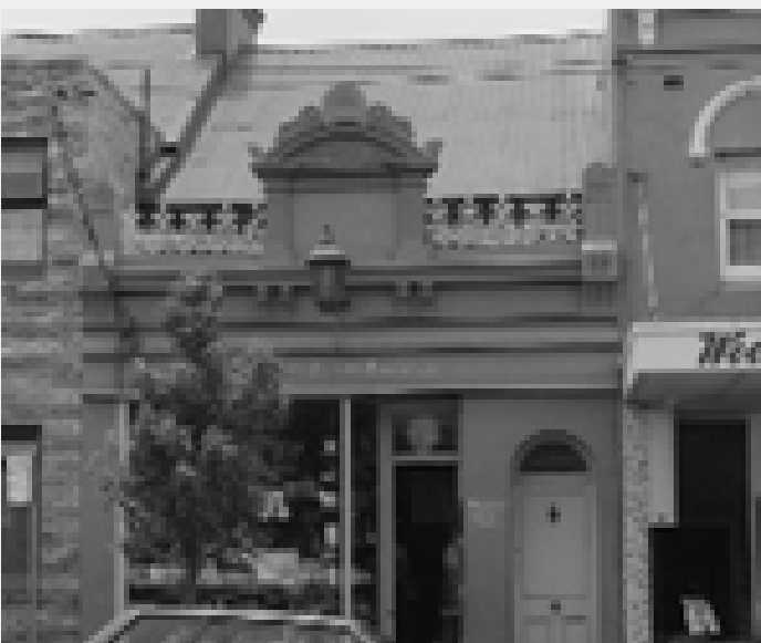
1982, West Woollahra Field Survey