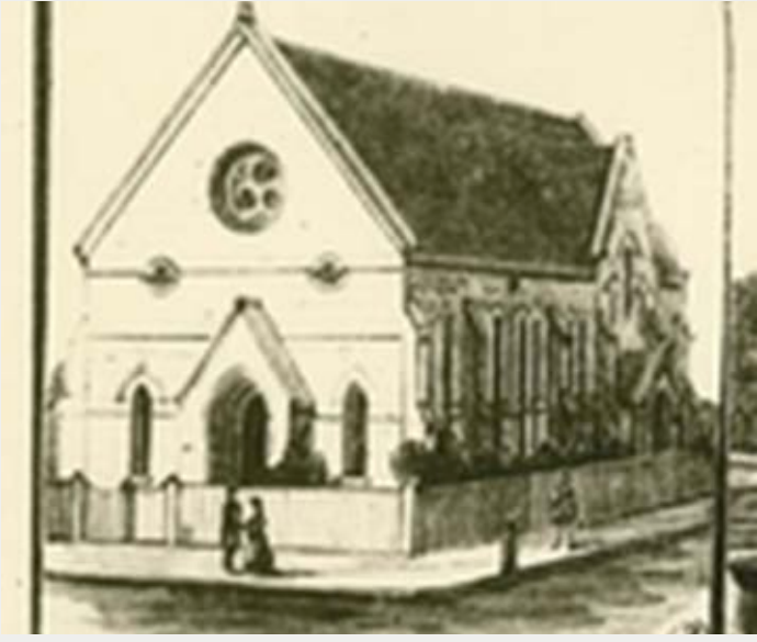
1884

On the north-western corner with Ocean Street, this group of interwar buildings masks a forgotten history. On 13 July 1866 city merchant David Jones laid the foundation stone of a Congregational Church that once graced this corner, alongside its school (built in 1870s). In 1923, the Ocean Street and the Jersey Road Congregational Churches merged, and demolition of the Ocean Street Congregation's buildings made room for the house on the corner, "Rosyth" and two residential flat buildings seen today.