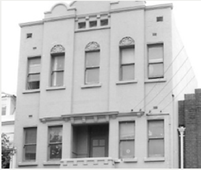
1982, West Woollahra Field Survey

(c1893) and Edward Cook (1898). The name “Woollahra Hotel” moved to the corner of Moncur and Queen in the 1930s (see Stop 6).