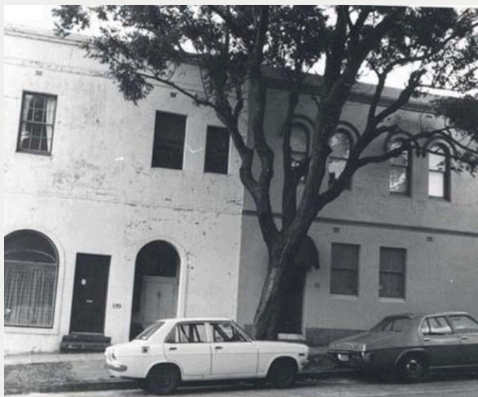
#170 (left) in 1976