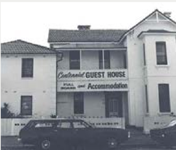
1976