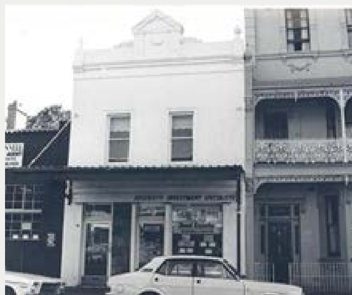
1976, Woollahra Libraries Digital Archive pf001874

This building, in the variety of its use, epitomises the history of the built environment of Queen Street. Described in 1870 as a four-room stone building, six years later the land supported a house and shop. The upper storey was added by 1880. The building later housed