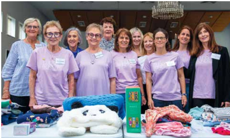
Cuddle Bundles used an Environmental Grant to help them purchase a new shed to store donated items.

'Cuddle Bundles' supplies vulnerable new mums with bundles of pre-loved baby wear and accessories, donated by other local families – reducing waste to landfill and contributing to a circular economy.