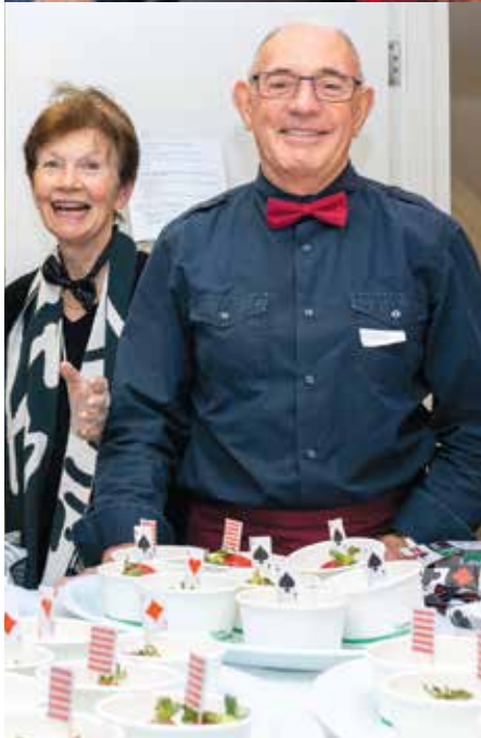
The South Head Anglican Parish's monthly community lunch, a 2022/23 grant recipient.