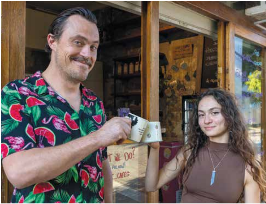
Tuckerbox's cup library