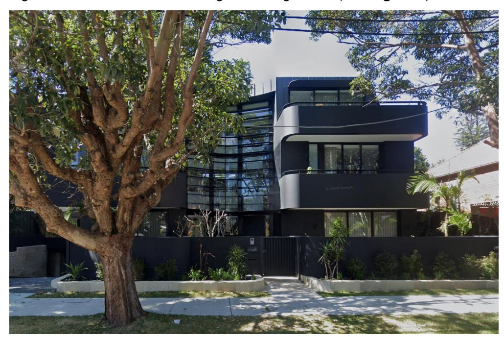
Figure 1: Approved RFB converted to a single dwelling house in Bellevue Hill.