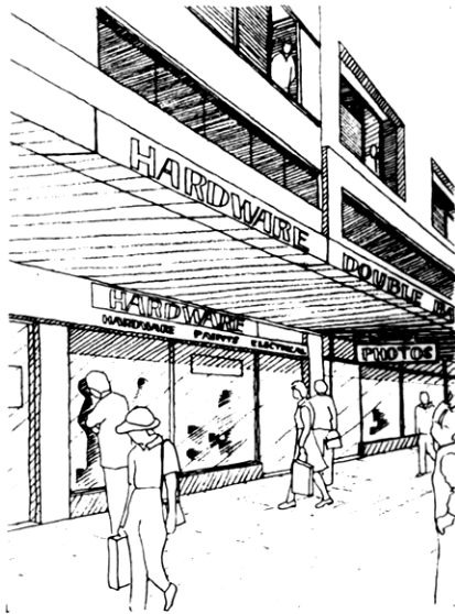
FIGURE 2 Example of signage on awning, top hamper and windows