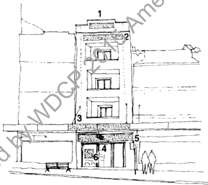
FIGURE 1 Types of signs

The objectives and controls in this section apply to signs in the centres and residential areas; additional controls for signage in heritage conservation areas (HCA) also apply, and are set out in Section 7.3 of this chapter. If there is an inconsistency between these general controls and the controls for the HCAs, the controls for the HCAs prevail.