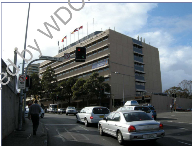
The Edgecliff Centre building